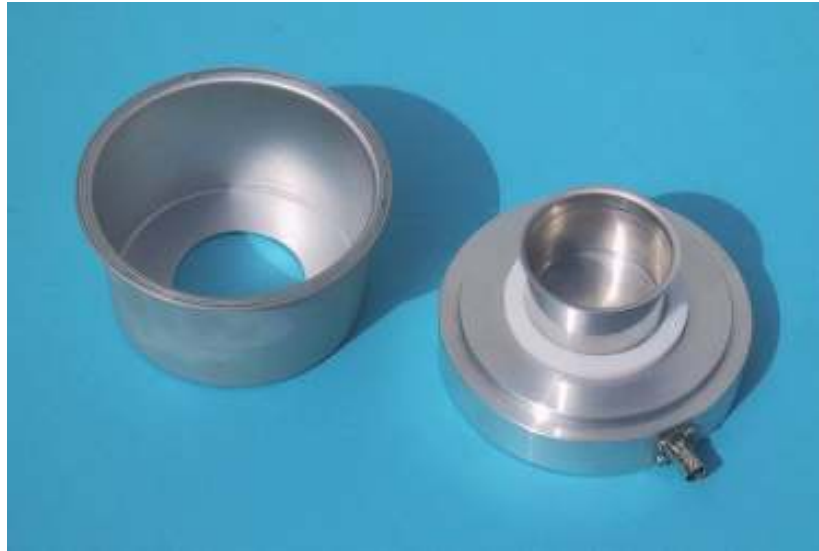
JCI 150 Faraday Pail: baseplate, BNC connector, insulation, pail and shield

If there is any doubt about the quality of the electrical insulation this may be tested by observing how quickly readings drift with time after zeroing and after charge has been introduced into the pail. The shield and the pail can easily be removed for emptying the pail and for cleaning.