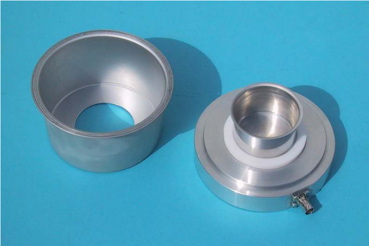
Figure 2: JCI 150 Faraday Pail: baseplate, BNC connector, insulation, pail and shield